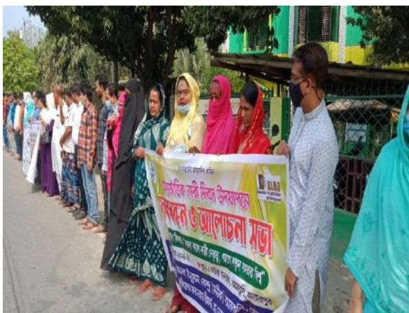
Human chain program by MUK to celebrate the occasion of Woman's Day.

MUK is a non-profit development organization dedicated to unfastening human potentials. MUK also has specialty on health areas. MUK has also adequate expertise in Arbitration sector. This shall make the organization major scope to earn revenue for its existence and mitigate grievance of community. MUK feels overconfident share its revenue generation activities through the following Units: