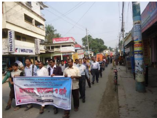
Rally on the occasion of International food Right's Day/2020 by MUK.