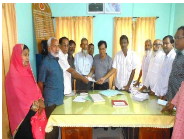
Jointly MUK and CAMPE submitted a local demand to the Upazila Education Officer to establish the right to education for all.