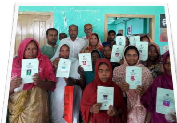
Demand letter presentation by the mothers of the epical child on the occasion of International Autism Day.